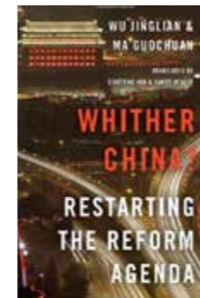
吴敬琏 教授 Prof. Wu Jinglian