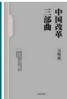
吴敬琏 教授 Prof. Wu Jinglian